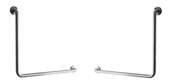
*Supplied as a two piece unit (pair).