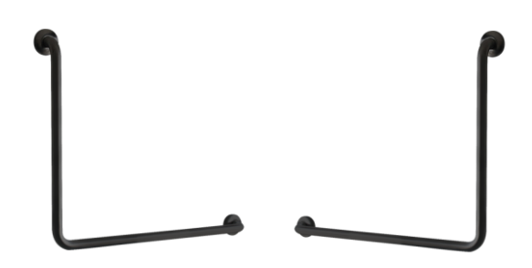
*Model options include Matte Black.