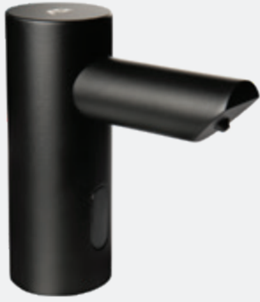
10-0390-3AC-41 EZ FILL™ LIQUID SOAP DISPENSER