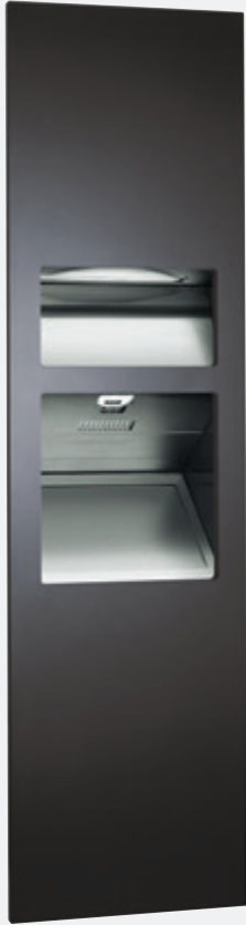
10-64672-2-41 PIATTO™ COMPLETELY RECESSED HAND DRYER, PAPER TOWEL DISPENSER & WASTE BIN