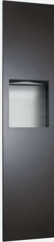
10-6467-41 PIATTO™ COMPLETELY RECESSED PAPER TOWEL DISPENSER & WASTE BIN