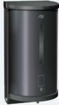
10-0362-41 AUTOMATIC LIQUID SOAP AND GEL HAND SANITISER DISPENSER