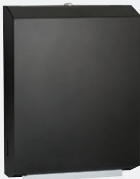
10-0210-41 SURFACE MOUNTED PAPER TOWEL DISPENSER