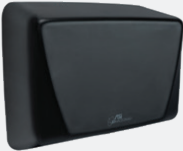
10-0199-2-41 TURBO-SLIM™ HIGH-SPEED HAND DRYER