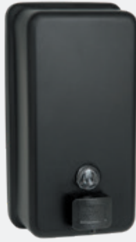
10-0341-41 VERTICAL LIQUID SOAP DISPENSER