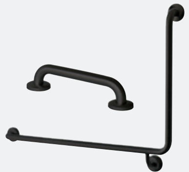
JDM-GTP-9-LH_41 GRAB RAIL SET 965X600MM + 300MM