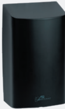
10-0194-2-41 TURBO-CHIC HIGH-SPEED HAND DRYER