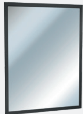
10-0600-41 SERIES INTER-LOK ANGLE FRAME MIRROR