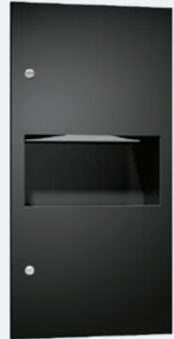
10-64623-41PC SIMPLICITY™ RECESSED PAPER TOWEL DISPENSER & WASTE BIN 10-64623-9-41PC - SURFACE MOUNT