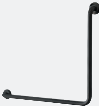
JDM-GAL-41 GRAB RAIL AMBULANT 450X450MM