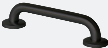
JDM-GSN-(3-6)-41 STRAIGHT GRAB RAIL AVAILABLE IN 300, 450 OR 600MM