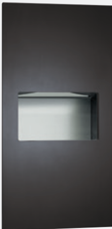
10-64623-41 PIATTO™ COMPLETELY RECESSED PAPER TOWEL DISPENSER & WASTE BIN