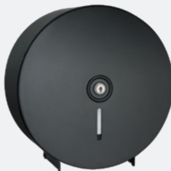
10-0042-41 JUMBO TOILET PAPER DISPENSER