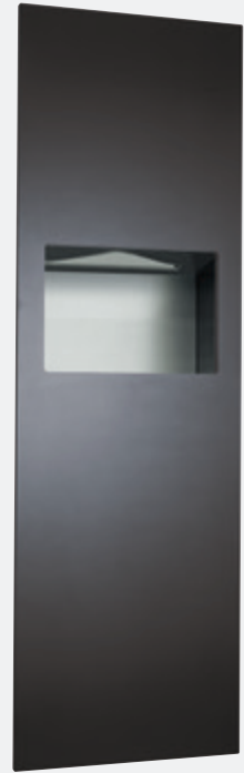
10-6462-41 PIATTO™ COMPLETELY RECESSED PAPER TOWEL DISPENSER & WASTE BIN