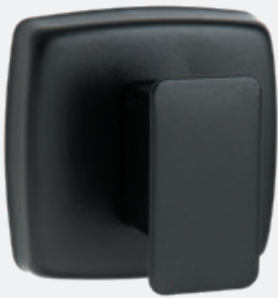
10-7340-41 SINGLE ROBE HOOK