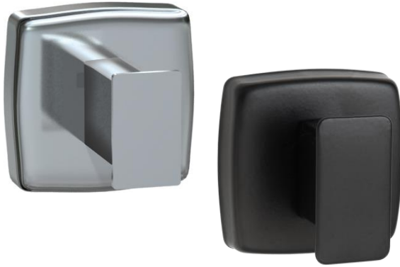
Models shown: 10-7340-S (satin finish) & 10-7340-41 (matte black finish)