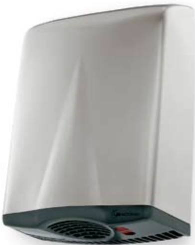
Applause Satin Stainless Steel APP02/SSS

Discretion is paramount when using public toilets. Excess noise is frowned upon. Even something as prosaic as the sound of a hand dryer can attract unwanted attention and even more so in executive washrooms. The alternative of paper towel is messy, expensive and often inconvenient when dispensers run dry.