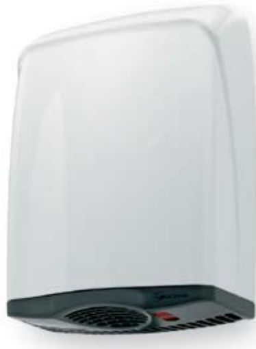
Applause Classic White APP02

steel finishes in part of the range also reduces the chance of scratching associated with regular use of abrasive commercial cleaners.