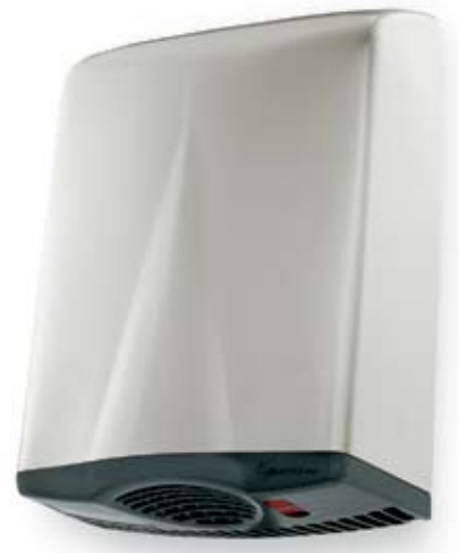
Applause Polished Stainless Steel APP02/PSS

The styling of the Applause unit, like all good industrial design, is